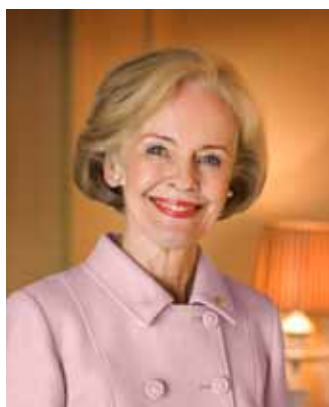
Her Excellency Ms Quentin Bryce AC, Governor-General of the Commonwealth of Australia

The RANZCOG Research Foundation has continued to grow and see its public profile increase over the past 12 months. We look forward to continuing our support of scientific and clinical research across all areas of women's health and the reproductive sciences.